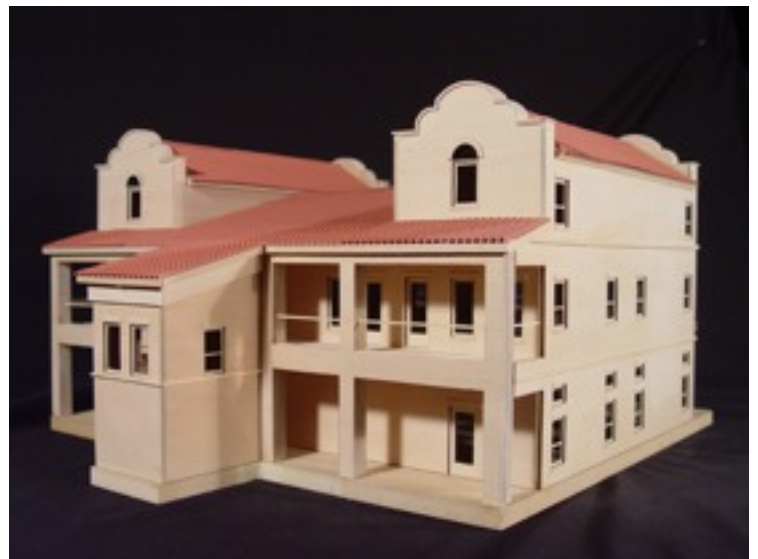
Model - Rear View