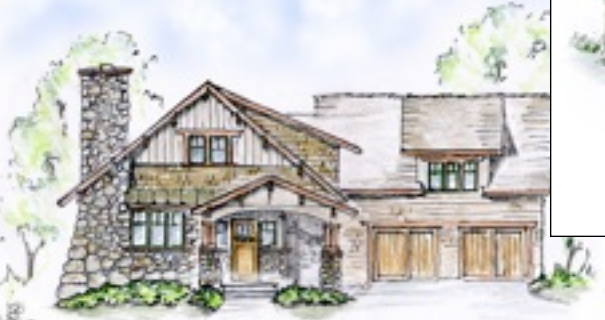
PRELIMINARY ELEVATION LOT 2