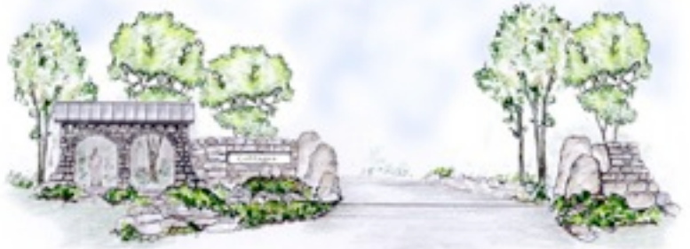
The Cottages Cresson Crossroads