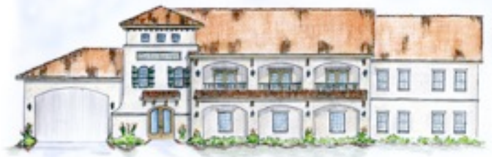
Conceptual Design for Hotel

Cresson Crossroads A Master-Planned New Town