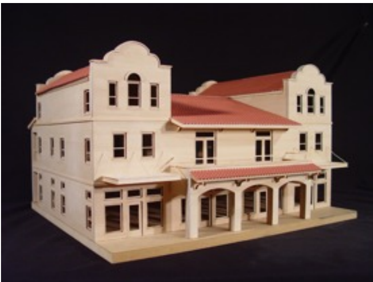
Model - Front View